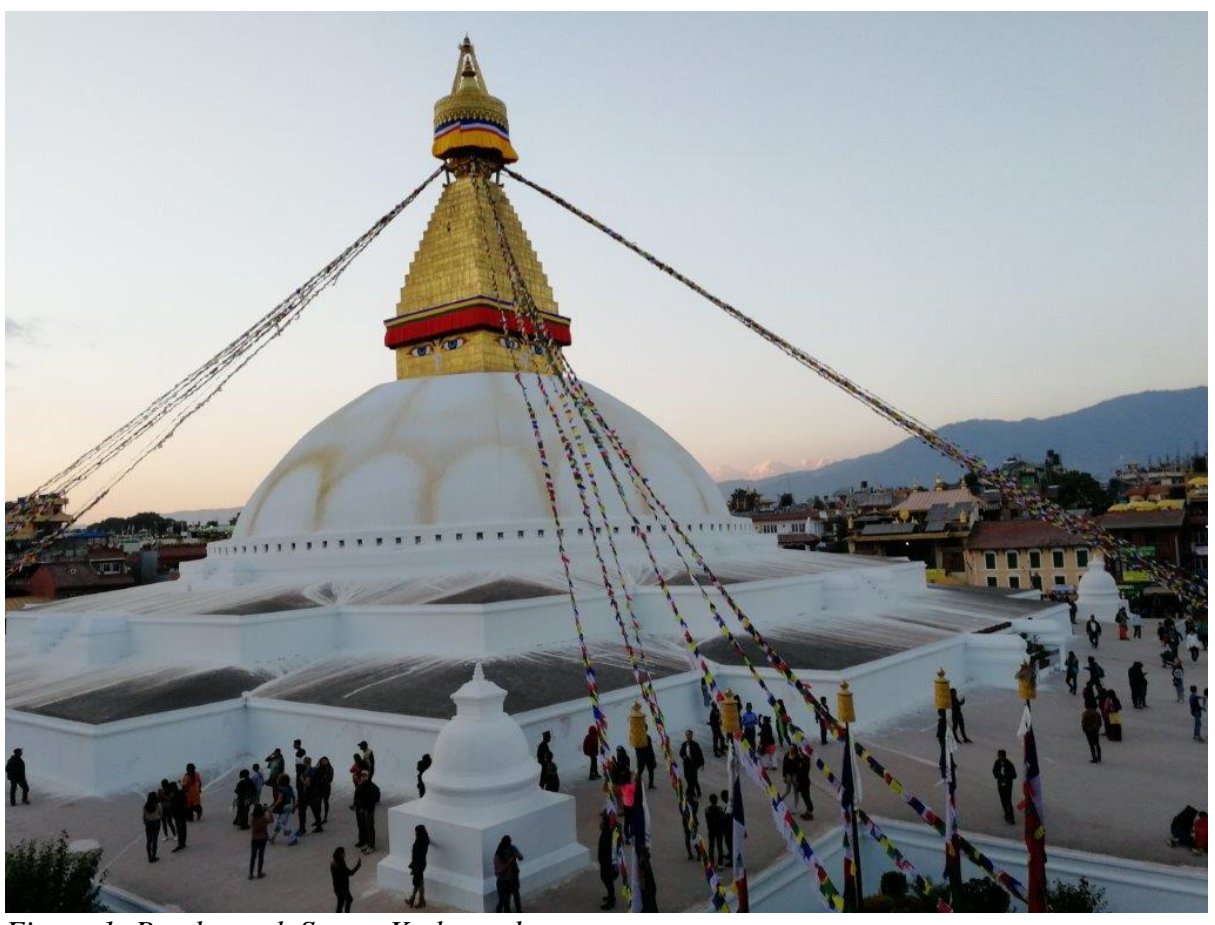
Figure 1: Boudnanath Stupa, Kathmandu

Day 17: We will travel about 15km in about 40 minutes from Kyirong to the Nepal/Tibet border crossing of Rasuwa. We will leave the Tibetan staff, cross the border at 10 AM (Chinese time which is 8 AM Nepal time), and walk over the bridge to Nepal where we have new cars for the 127 Km drive to Kathmandu, Boudhanath in about 5-6 h. End of service!