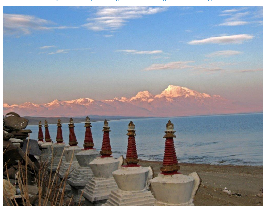
Day 18: Kathmandu on your own (return flights can be arranged from this day, June 26 and onward)

Day 17: Border drop 10 Am – Resuwa to Kathmandu/ end of service 25 June 2024