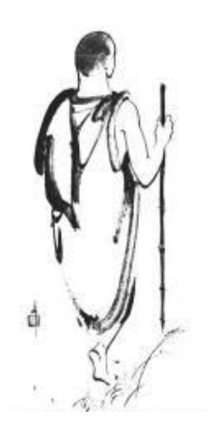
May all beings be happy!

Passport Validity: Minimum 6 months from date of entry.